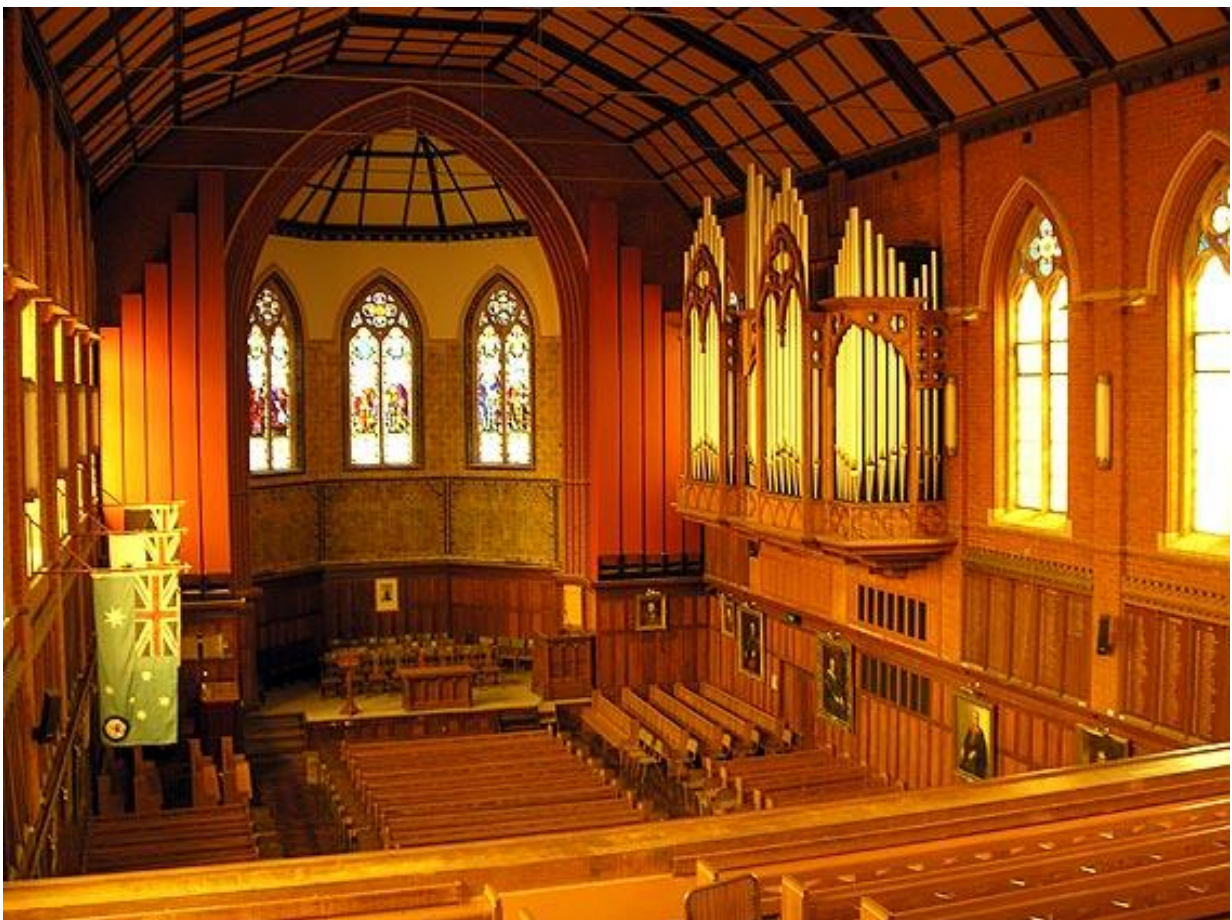
Memorial Hall at Scotch College, Melbourne

He is also remembered on the Scotch College Melbourne, World War 1 Commemorative Website.