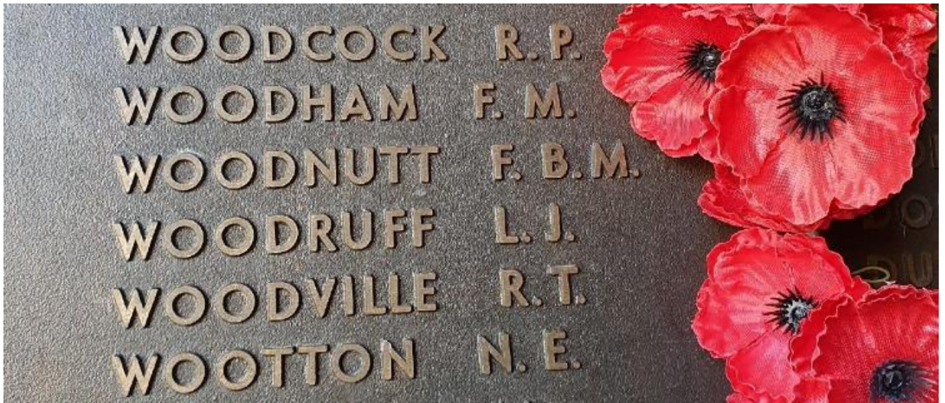
Roll of Honour at Australian War Memorial